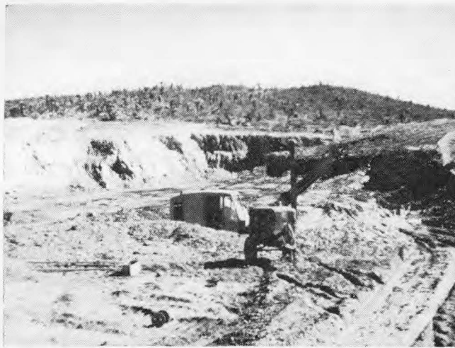
THIS PIT , Southwestern Talc's No. 4, is currently producing 40 to 50 carloads per month of ceramic-grade talc.