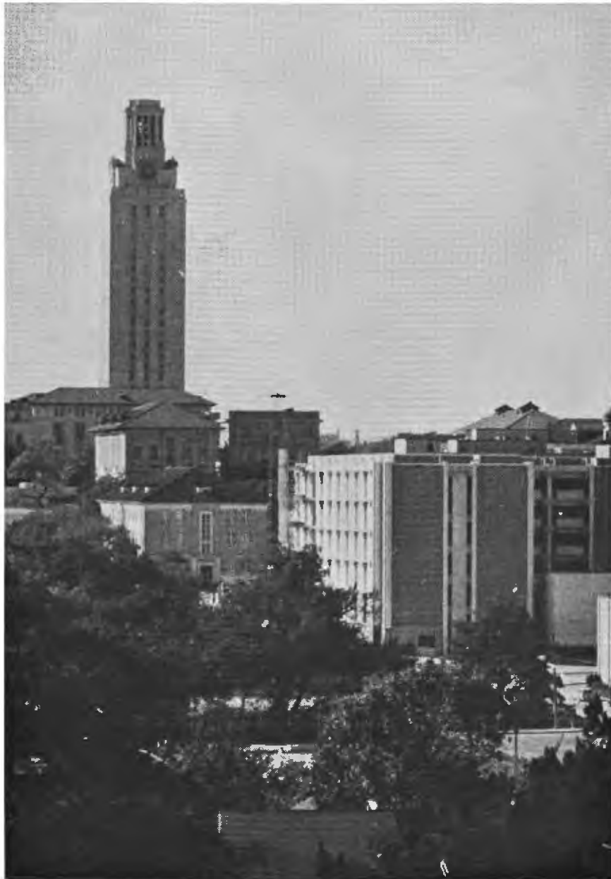
The new Geology Building in December 1966. View toward northwest.

late February or early March. All of the Bureau's research and administrative offices will be housed in the new structure; the Mineral Studies Laboratory and the Well Sample and Core Library will remain at Balcones Research Center.