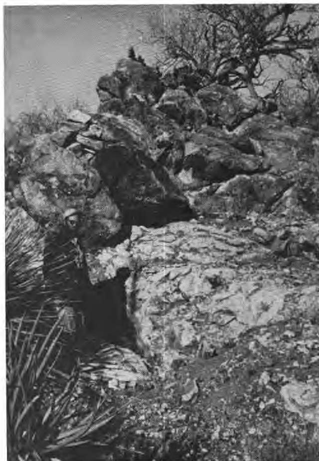
Beryllium prospect in the Quitman Mountains, Hudspeth County, Texas. January 1962.

This annual publication, which is a preprint from the U. S. Bureau of Mines Minerals Yearbook , contains information on the quantity and value of mineral production in the State during the year.