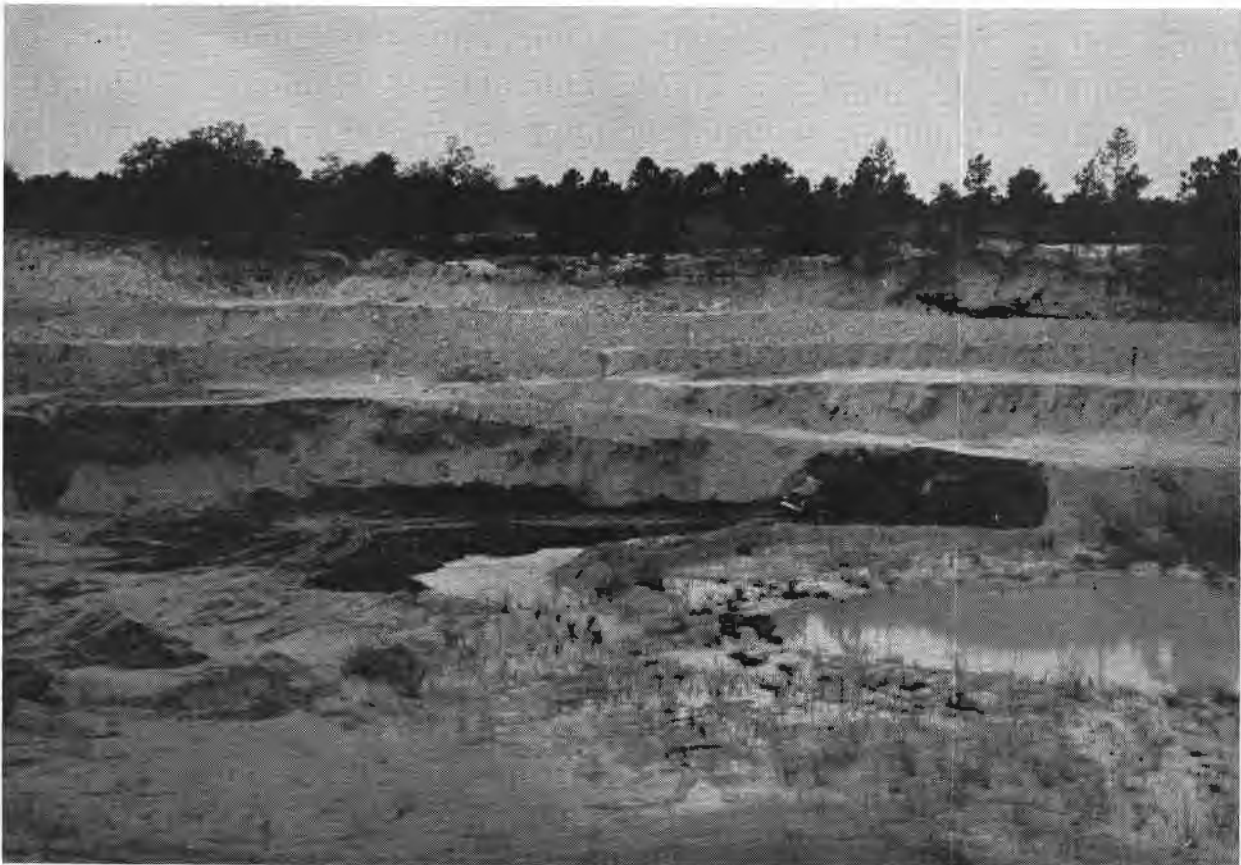
Bennett-Clark Company's bentonite pit south of Zavalla, Angelina County, Texas. 1962.

expand its research in clay mineralogy and Texas clay mineral resources. The new equipment will be housed with existing Department of Geology X-ray equipment to create an X-ray laboratory with greater capacity for teaching and research.