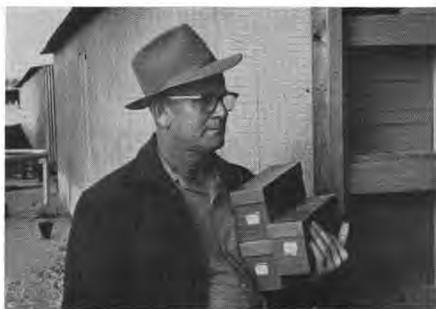
New low-cost warehouses at the Well Sample and Core Library, Balcones Research Center.

A new index of well samples and cores in the Bureau's Library is scheduled to go to press early in 1963.