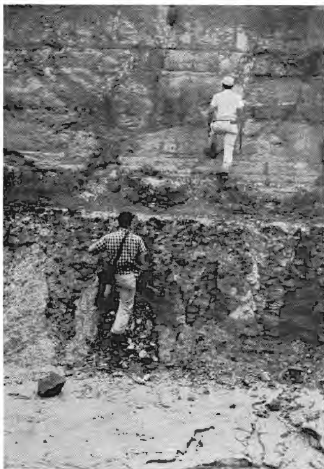
Ball clay underlying Carrizo Sandstone, General Refractories Company's clay pit near Troup, Cherokee County, Texas. 1962.