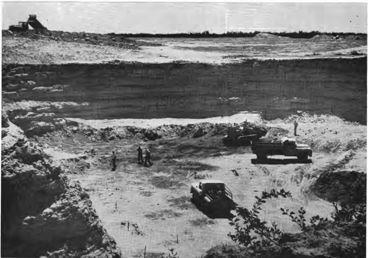
Susquehanna-Western, Incorporated's, Mabel New uranium mine in Live Oak County, Texas. August 1962.