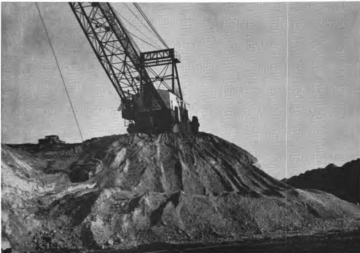
Dragline stripping at the Darco lignite mine of Atlas Chemical Industries, Inc., Harrison County, Texas. September 1962.

The nonmetallic industrial minerals have a low unit value and cannot move very far in trade due to transportation costs. However, they are consumed in large quantities by industry, and their development is a necessary accompaniment to industrialization. Furthermore, in our rapidly expanding and changing technology, new uses are being developed for nonmetallic materials particularly in the ceramic industries; mineral commodities that in the past have been of limited interest may suddenly acquire a new importance. Therefore, a complete and up-to-date mineral inventory of an area is a necessary part of any program for industrial development.