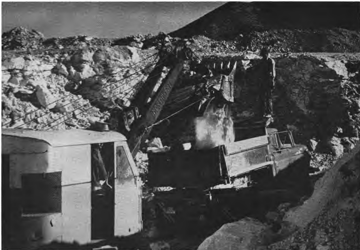
Open-pit mining of massive barite, Continental Minerals' mine, Culberson County, Texas.

Susquehanna-Western, Inc., developed its Mabel New uranium mine in Live Oak County; ore shipments to the Falls City mill began in May of 1962.