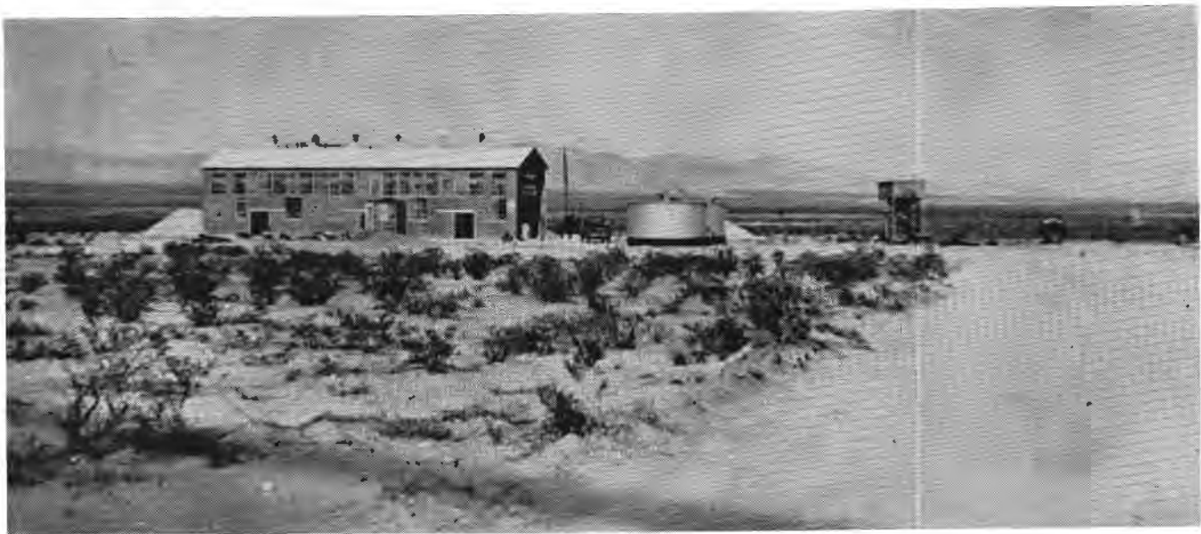
Continental Minerals' new barite mill near Van Horn, Texas, processes ores from the Seven Heart Gap area of Culberson County.

The McDonough Company began construction of a 1.5 million barrel per year wet process cement plant near Houston. Texas Gypsum Company's wallboard and plaster plant in El Paso went into operation early in 1961. Bentonitic clays were processed at Flatonia by Balcones Minerals Corporation to produce absorbent materials.