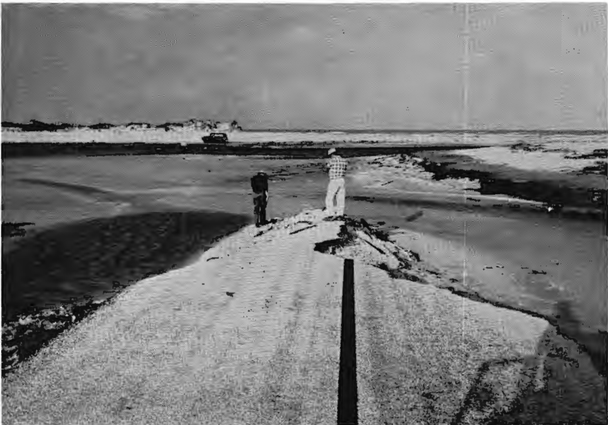
Geologic forces in action. Hurricane Carla struck the Texas Coast in September and provided dramatic evidence of how natural forces shape the land. The photo shows a new channel cut through a paved road on Mustang Island.