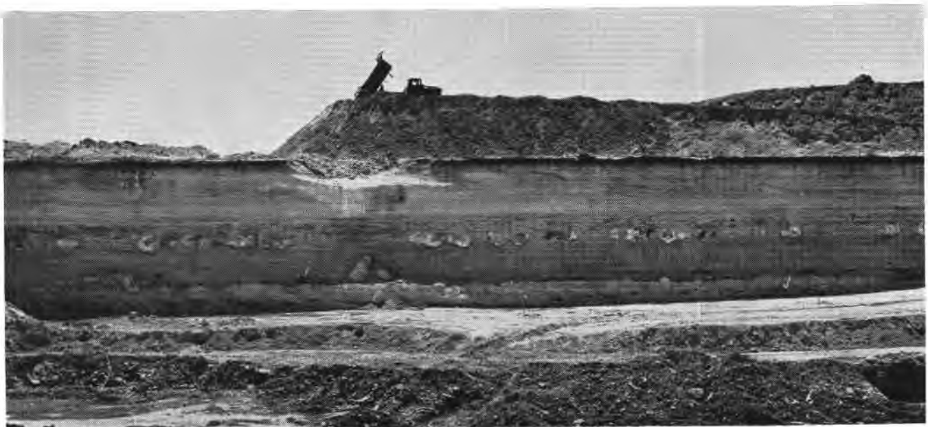
Lockett open-pit uranium mine, Karnes County. Large calcareous concretions occur in clay of the Stone's Switch Sand just above the ore zone; the floor of the pit is on Conquista Clay.

Beryllium. —During 1961 the United States Bureau of Mines and several mining companies were exploring for beryllium in Trans-Pecos Texas.